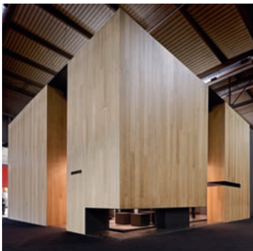
SLEEK OAK WALLS WERE DESIGNED TO CREATE MAXIMUM IMPACT IN MINIMUM TIME.